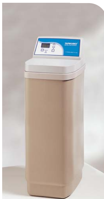
AD 15 A real powerhouse softener with the capacity to soften over 3000 litres per day