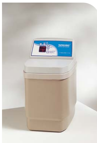
Ultra 9 Our most compact softener, easily concealed in a kitchen cupboard