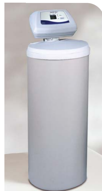
NSC40 UD1 High capacity softener suitable for larger households and commercial applications