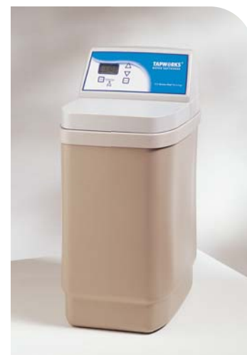
AD 11 Our most popular domestic softener